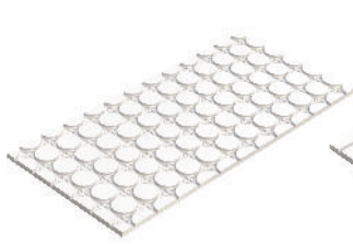
ULTRA PRO 100. R