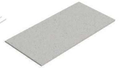
ULTRA PRO LOW DECK.