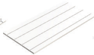
ULTRA PRO 150. SR